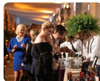
Guests enjoy the wine tasting and silent auction.