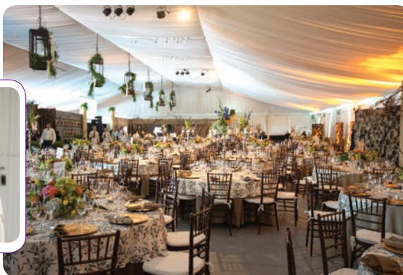
The beautiful setting at Donamire Farm