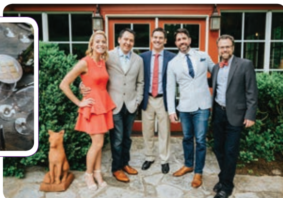
Memento Mori Winery 2016 Vintner Chairs