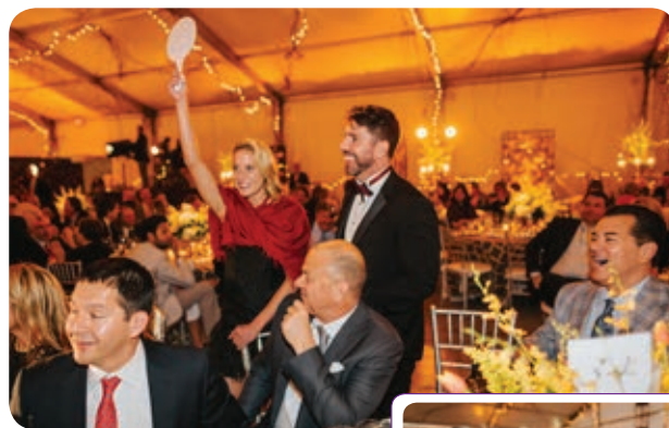
Above: The 2016 Auction was lively and exciting throughout the evening; right: the Mercedes Benz auction lot

Businesses and supporters who wish to join LCF in our mission by donating an item or items to the 2017 auction are encouraged to visit the LCF website for more information. Contributions help LCF award grants to many worthy cancer causes, and offer businesses the opportunity to showcase wonderful products and services.